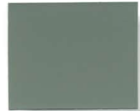
Old Town Gray